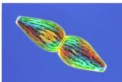
(Pleurotaenium algae, polarized light microscopy)